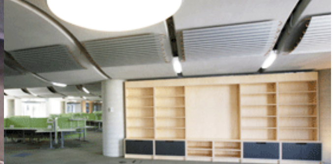
The "green" ceiling necessitated an under floor installation