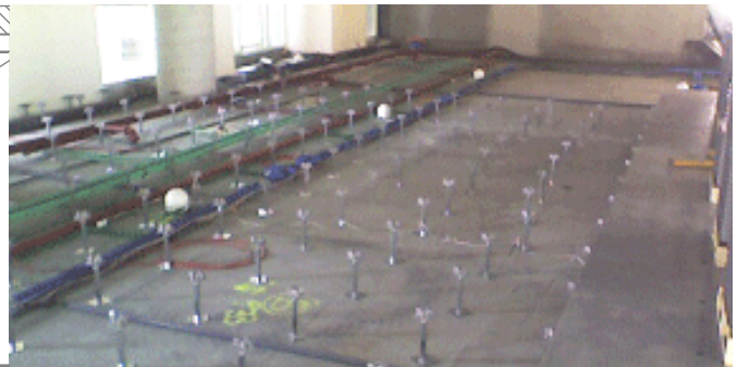
Soundmask installation laid out prior to floor installation

The CH2 "world's greenest office" building was so quiet that it required the introduction of an under floor Soundmask system. The services, including Soundmask's transducers are installed under the Tasman Access floor, as there are no suspended ceilings. This floor was manufactured from steel and concrete composite, requiring powerful transducers to ensure the correct penetration of sound.